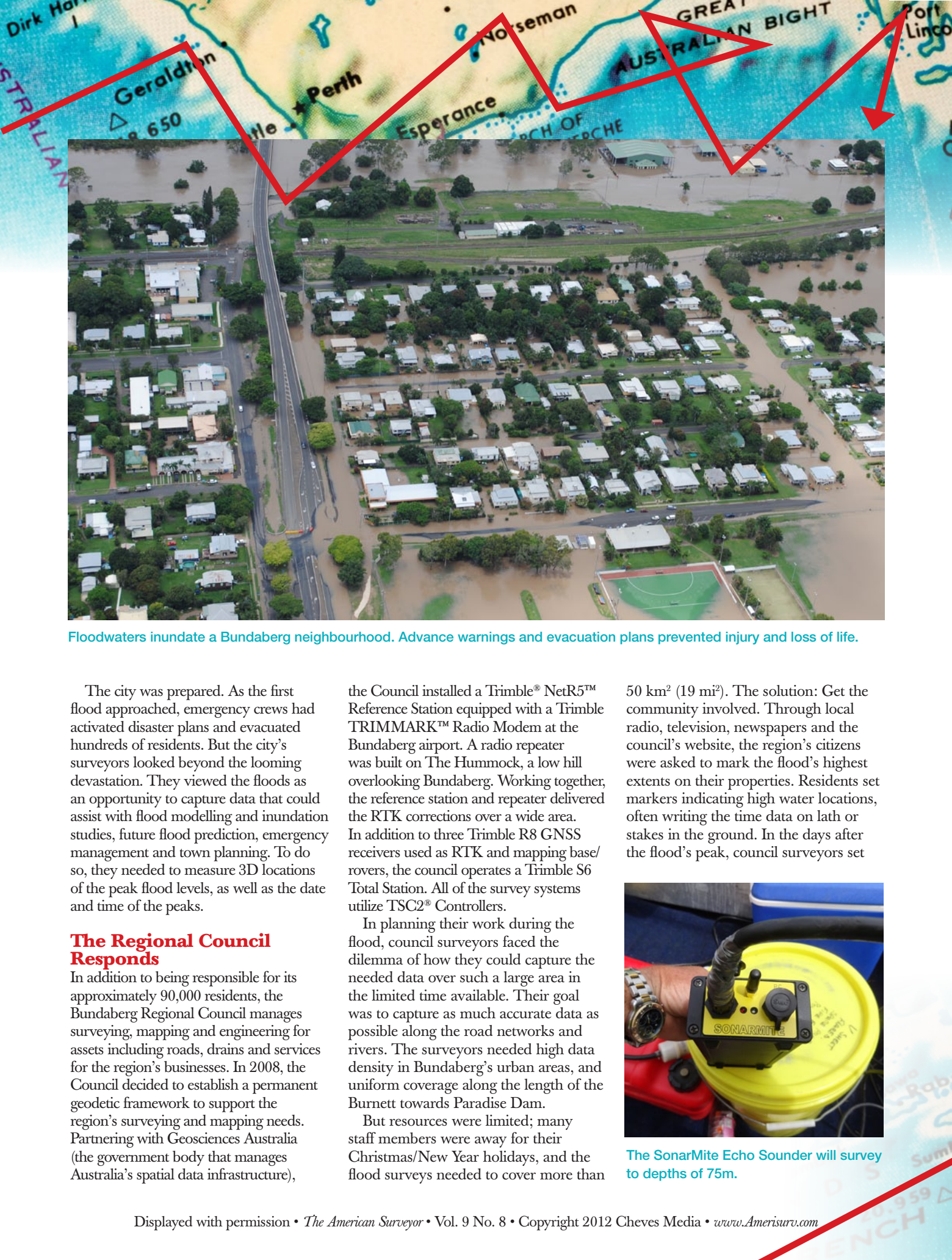
Floodwaters inundate a Bundaberg neighbourhood. Advance warnings and evacuation plans prevented injury and loss of life.

The city was prepared. As the first flood approached, emergency crews had activated disaster plans and evacuated hundreds of residents. But the city's surveyors looked beyond the looming devastation. They viewed the floods as an opportunity to capture data that could assist with flood modelling and inundation studies, future flood prediction, emergency management and town planning. To do so, they needed to measure 3D locations of the peak flood levels, as well as the date and time of the peaks.