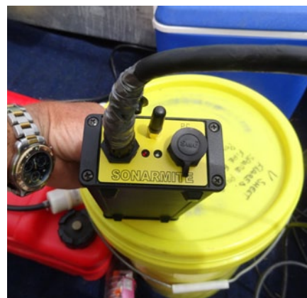
The SonarMite Echo Sounder will survey to depths of 75m.

50 km 2 (19 mi 2 ). The solution: Get the community involved. Through local radio, television, newspapers and the council's website, the region's citizens were asked to mark the flood's highest extents on their properties. Residents set markers indicating high water locations, often writing the time data on lath or stakes in the ground. In the days after the flood's peak, council surveyors set