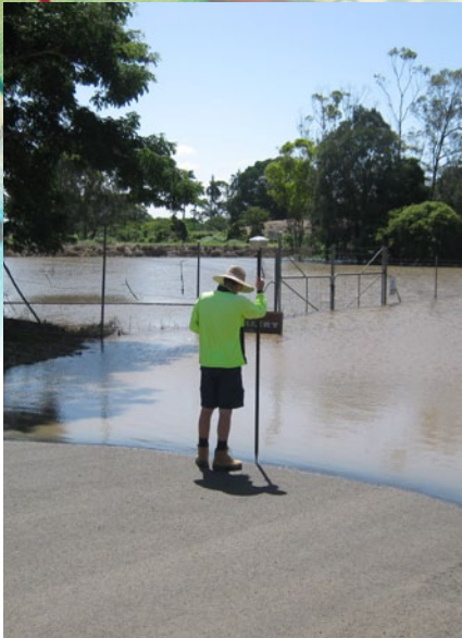
A Bundaberg surveyor measures the highwater mark on a roadway. Teams made periodic visits to key locations to monitor the flood's progress.