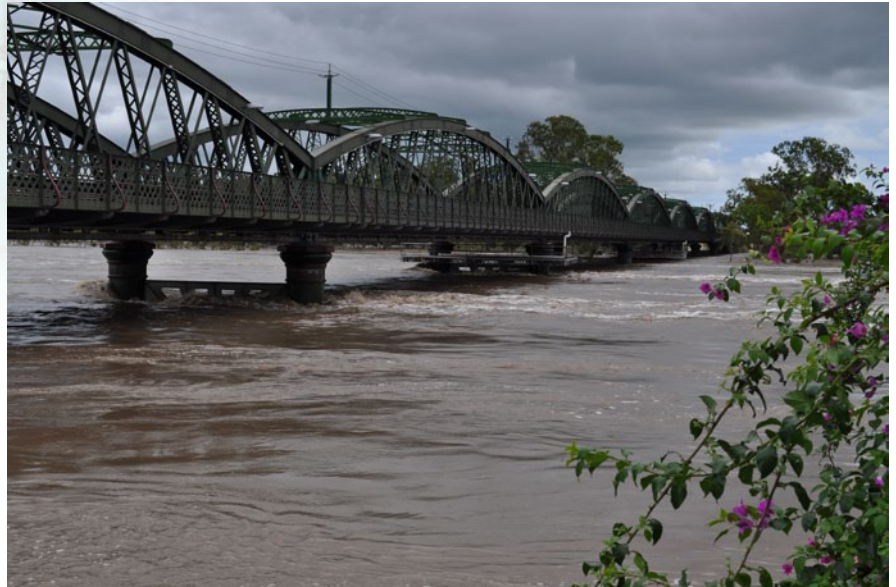
First opened August 24th 1900 the Burnett River Traffic Bridge located in the heart of Bundaberg has seen many floods in its time. On December 30th 2010 it once again stood in defiance of the floodwaters.

about measuring flood extents marks on each property and indicators such as flood debris in trees and fences. Most of this work was done with two Trimble R8 GNSS receivers acting as rovers using RTK corrections from the airport base station. Outside the City of Bundaberg, the Trimble R8 GNSS receivers were used as a mobile base/rover combination to cover those areas outside the permanent base station range.