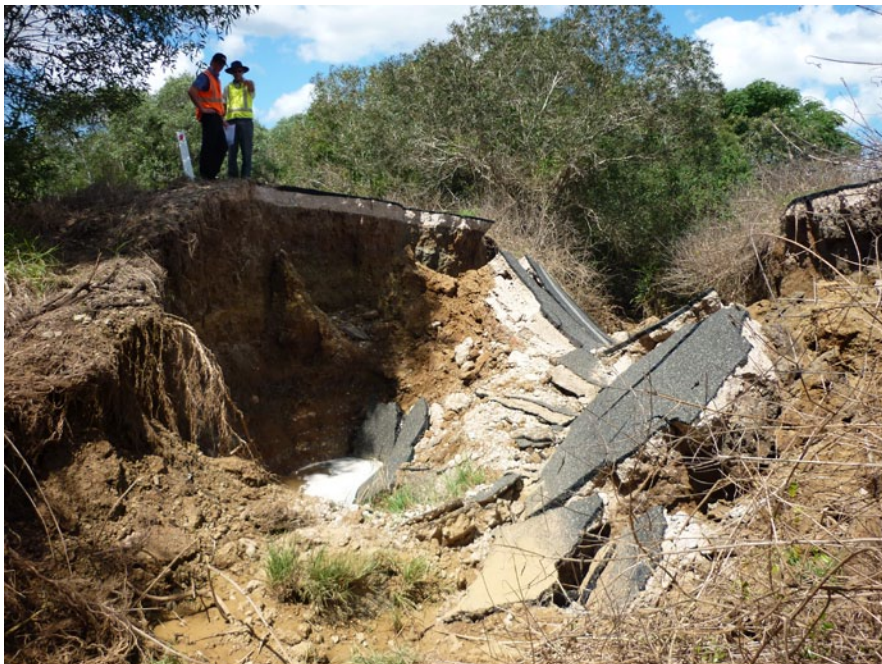
Teams inspect a road washout. Floodwaters reached the highest levels in 60 years.

John Clucas is a freelance writer in Australia's construction industry.