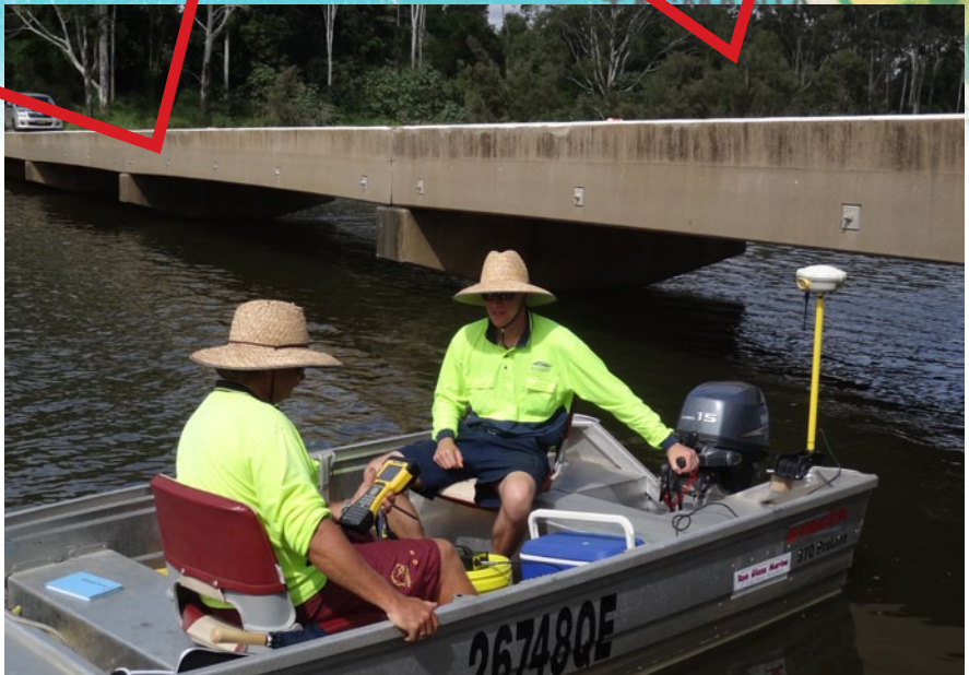
Council surveyors conduct post-flood bathymetric surveys on the Burnett River. Sonar and GNSS positions provide cross section data for riverbed analysis and flood modelling.

Three months after the floods, the fieldwork was complete. Each piece of data carried a date and time stamp as well